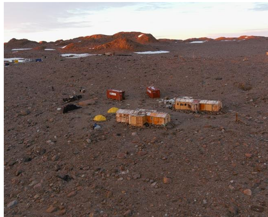
A. B. Dobrowolski Polish Antarctic Station in Bunger Hills, East Antarctica on January 2022.