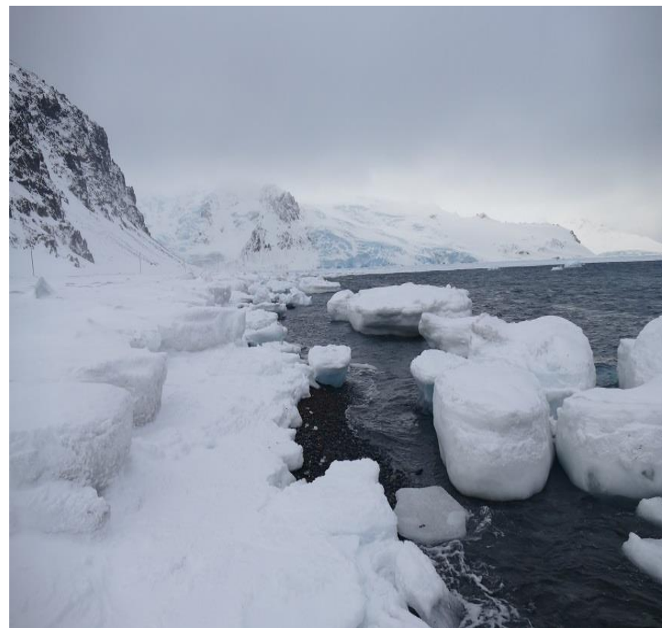
Snow covered and impacted by ice intertidal zone in November 2017. The study site was selected in Admiralty Bay in the direct vicinity of the Polish Antarctic Station (62° 09.41' S; 58° 28.10' W).

To understand the impact of anthropogenically induced transformations of biological communities, their naturally occurring fluctuation must be recognized first. Therefore, the aim of our study was to investigate the variability in Antarctic intertidal benthic assemblage faunal composition during an annual cycle on King George Island, South Shetland Islands. Once a month, from December 2016 to November 2017, we collected samples at low-, mid- and high-tidal levels. Polychaetae were the most diverse group, including 15 species, followed by amphipods (12 species). Throughout the year, the most abundant taxa were gastropods (38% of the total number), followed by amphipods (23%) and bivalves (22%). The general pattern of the number of species and their abundance and biomass depended on the season and exhibited the highest values in austral autumn (April–June). Both species richness and abundance were highest in June and lowest in August. Our study discovered that Antarctic intertidal macrofauna assemblages quickly respond to changes in environmental conditions and thus reflect seasonal climate fluctuations. The rapid development of these assemblages when the conditions are favorable proves their opportunistic and highly adaptable nature, which is potentially a good prognosis for survival in this ever-changing ecosystem.